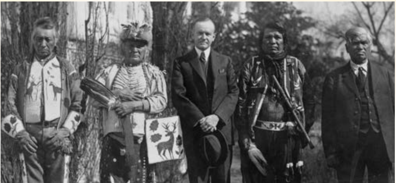
Calvin Coolidge First Administration, Herbert E. French, National Photo Company, v. 2, p. 41, no. 34318, National Photo Company Collection, Library of Congress

Through the 1924 Indian Citizenship Act, Congress granted citizenship to all Native Americans born within the territorial limits of the United States. 40 The new law meant that Native Americans were no longer required to shift allegiance from their tribe to the United States as the law recognized that such dual allegiance was not a conflict. 41